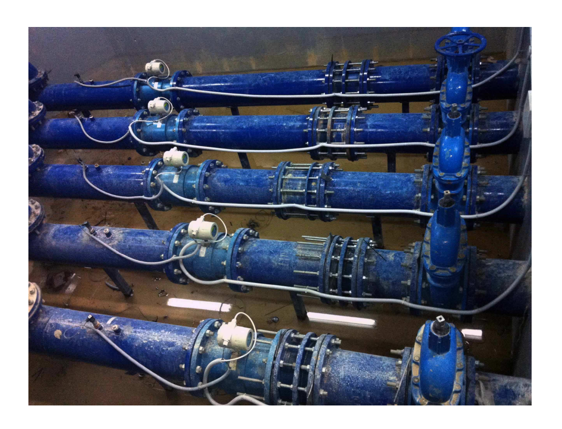
EGYPT - El Ayat Water Treatment plant We installed 6 EMF sizes DN300 to DN1200