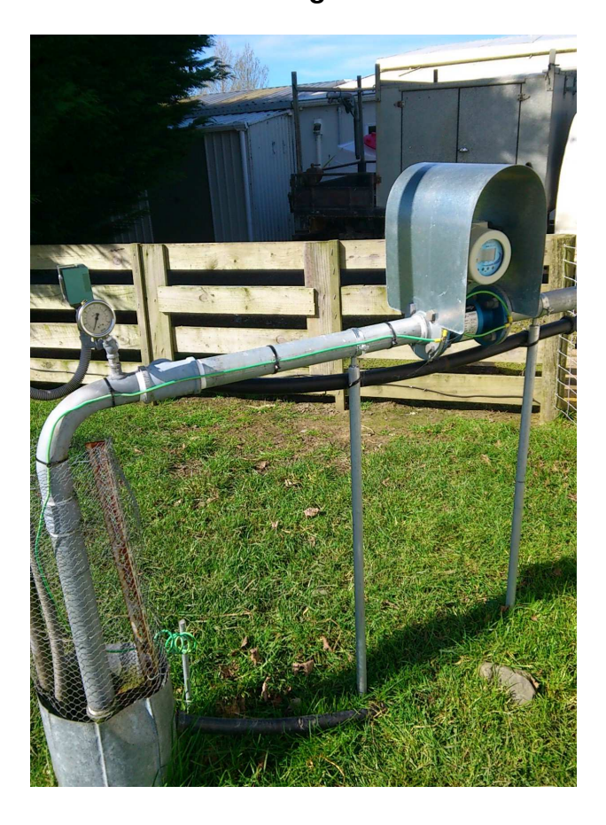
FINLAND - Waste water treatment