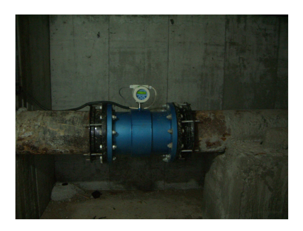
TURKEY – Melen Municipality We installed 2 EMF size DN2000 and 3 size DN1400