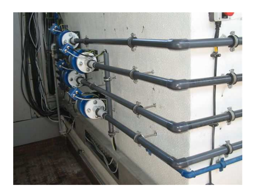
USA Chemical company dealing with raw materials to the concrete industry