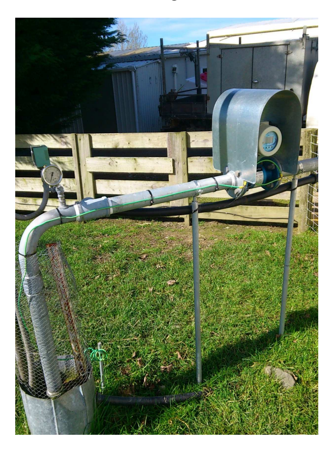
FINLAND - Waste water treatment